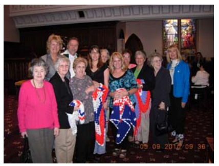
Shawl Presentation (May 9, 2010)