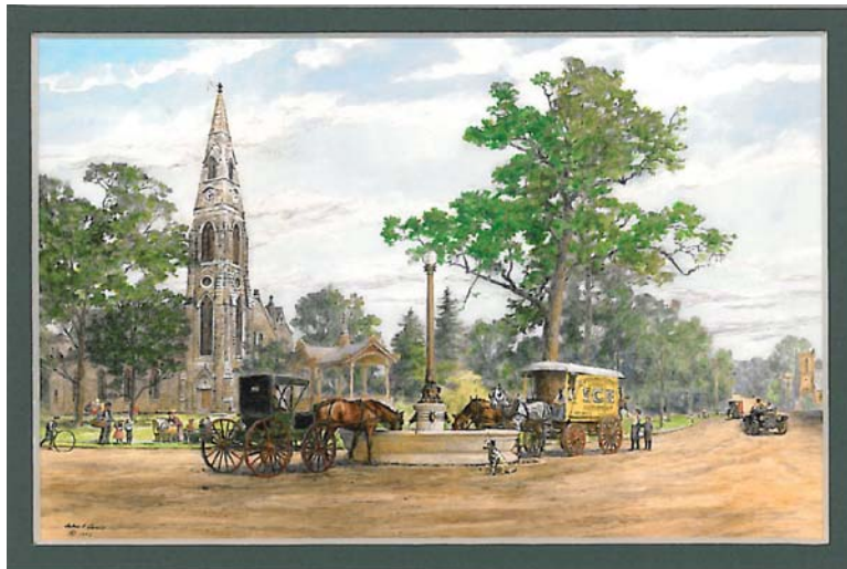
Reprinted with permission

Tickets may be purchased during coffee hour or at the church office during the week.